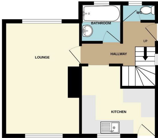
GROUND FLOOR 376 sq.ft. (34.9 sq.m.) approx.